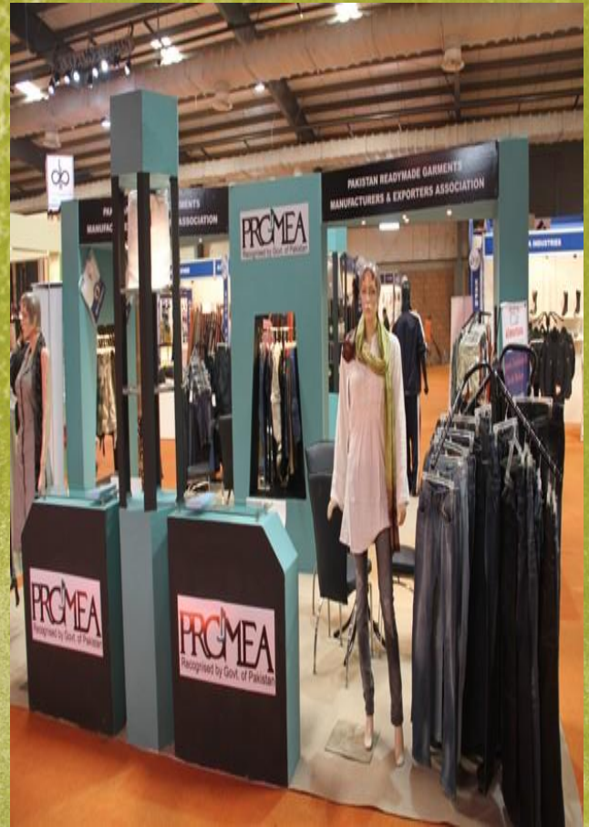
PRGMEA Stall at 6 th Expo Pakistan, Karachi

"The government should also provide uninterrupted supply of gas and electricity to the manufacturing units to ensure timely production so that the export consignments could sail off without any delays," Chief Co-ordinator, Prgmea demanded. He was of the view that the Karachi violence had also disturbed business activities in upcountry as the metropolis was the financial and economic hub of the country with two seaports.