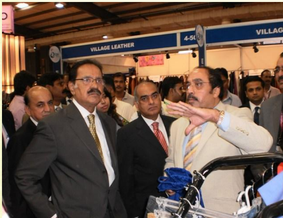
Mr. Makhdoom M. Amin Faheem, Pakistani Senior Minister for Commerce visited PRGMEA Stall at 6 th Expo Pakistan, Karachi.